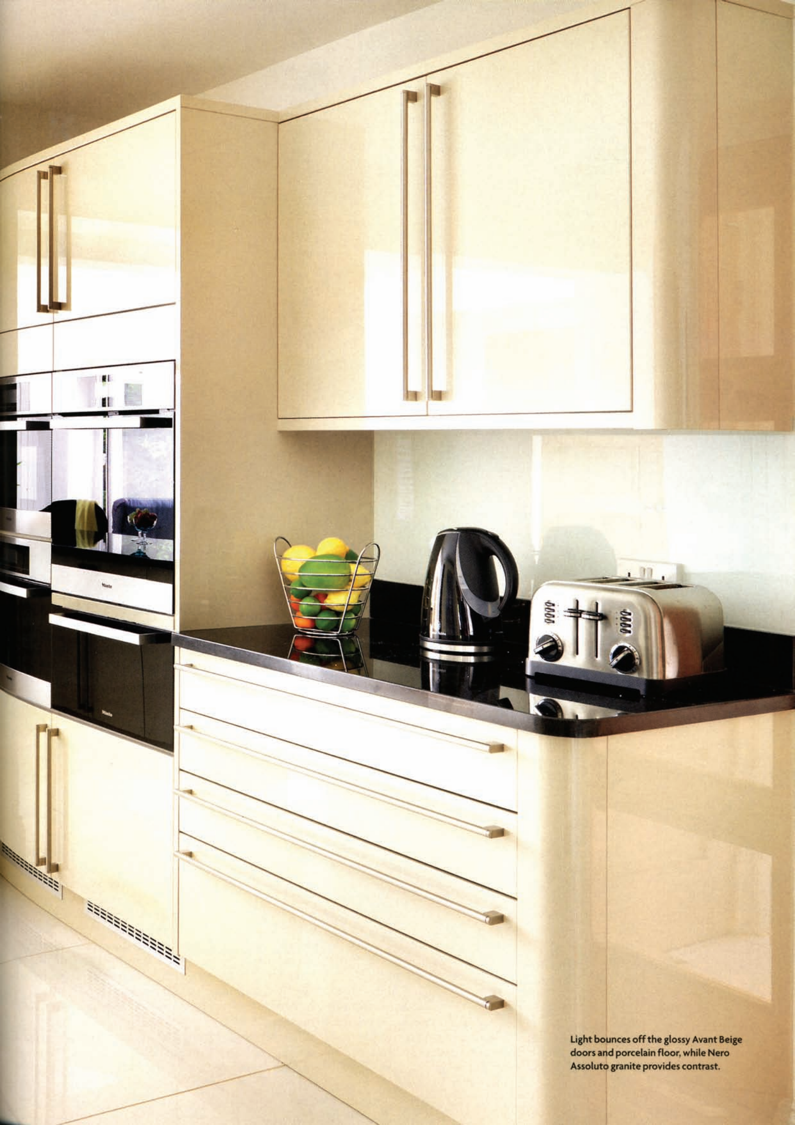
Light bounces off the glossy Avant Beige doors and porcelain floor, while Nero Assoluto granite provides contrast.