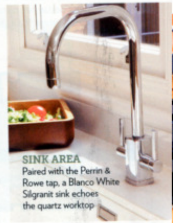
SINK AREA Paired with the Perrin & Rowe tap, a Blanco White Silgranit sink echoes the quartz worktop