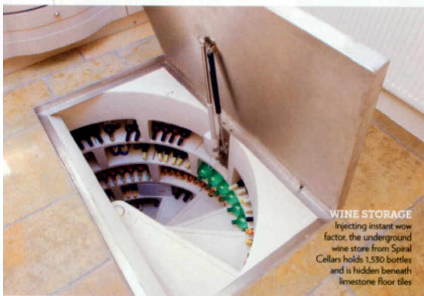
WINE STORAGE Injecting instant wow factor, the underground wine store from Spiral Cellars holds 1,530 bottles and is hidden beneath limestone floor tiles

DESIGNER'S TIP 'Different worktop materials can help prevent a large space from appearing bland. Quartz is more durable in wet areas than timber, which needs lots of maintenance' VICTORIA HUDSON