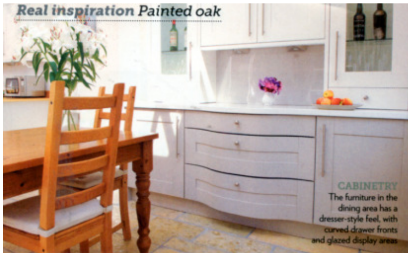
CABINETRY The furniture in the dining area has a dresser-style feel, with curved drawer fronts and glazed display areas

DESIGNER'S TIP 'Different worktop materials can help prevent a large space from appearing bland. Quartz is more durable in wet areas than timber, which needs lots of maintenance' VICTORIA HUDSON