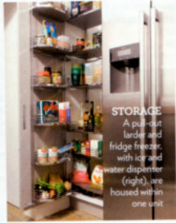
STORAGE A pull-out larder and fridge freezer, with ice and water dispenser (right), are housed within one unit