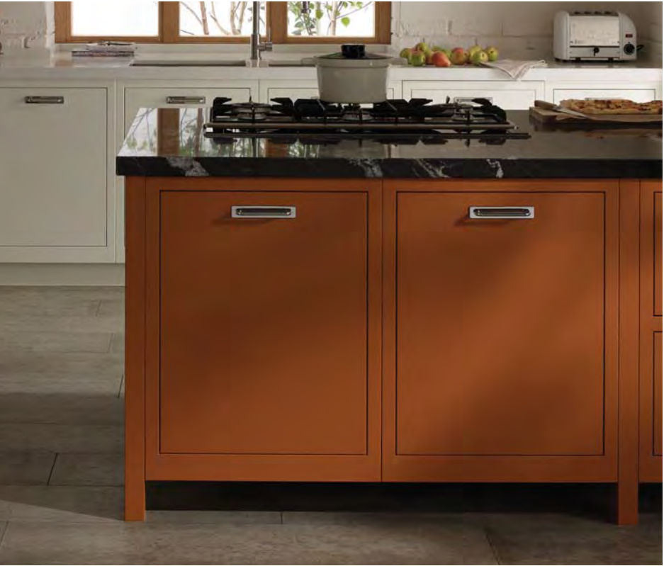
Printed colours on this page may not be exact.